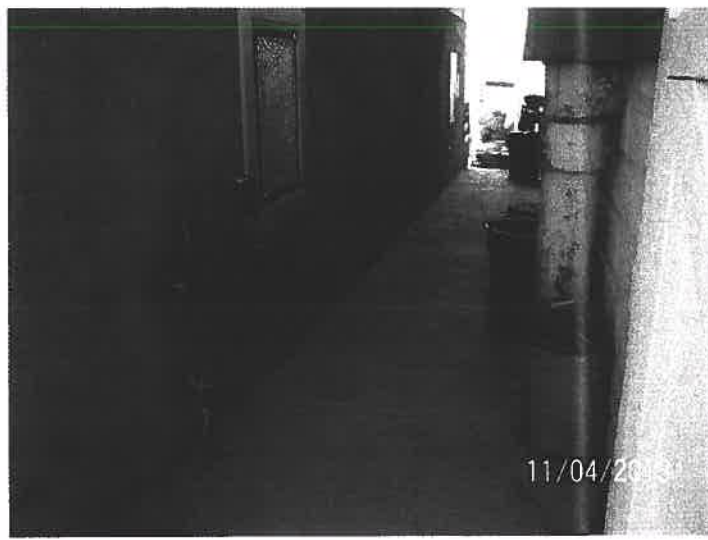
Right Side View – Date of Photograph: (See Photo Stamp)